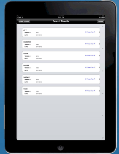
List of Invoices to Approve