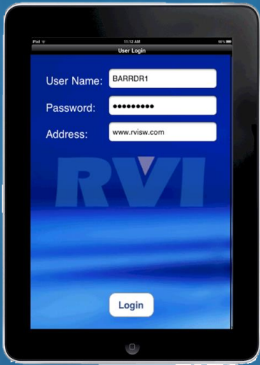
Manager signs onto system