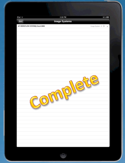
Enjoy Your Day!