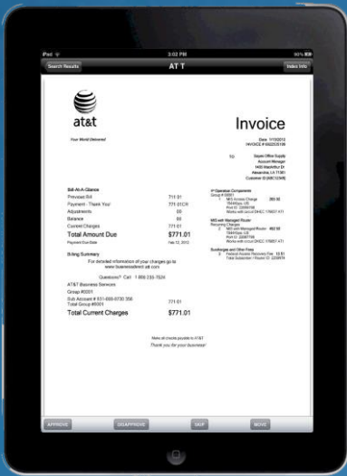
You May Approve, Disapprove, Skip or Move Invoice to another Route